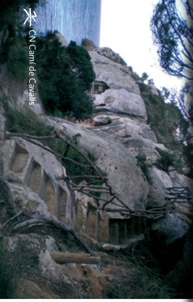
CN Camí de Cavalls

L'Anell Verd (Barcelona). This route joins the municipalities of Sant Boi de Llobregat, Santa Coloma de Cervelló and Sant Climent