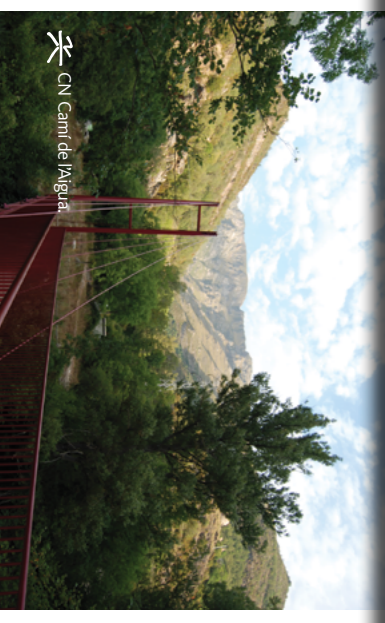
CN Camí de l'Aigua

La Sèquia (Barcelona). According to the records, in the 14th century, the municipality of Bages suffered a devastating drought. The solution arrived in 1383, when the construction of La Sèquia, a 26 kilometre-long canal which has been taking water from Llobregat River from Balatny to Manres.