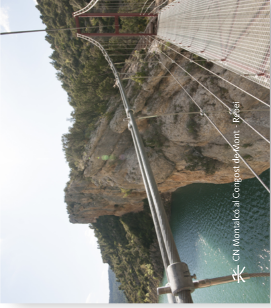
CN Montfalcó al Congost de Mont-Rebei

Covering a relatively small territory, the 21 Nature Trails that cross the Autonomous Communities of Catalonia (19 Nature Trails) and the Balearic Islands (the other 2 Nature Trails) offer a striking landscape and cultural diversity. Some of these trails lead us into the valleys of the Pre-Pyrenees and some run out to the sea, crossing the fertile valleys and flood plains of the lower Ebro valley.