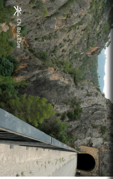
CN Baix Ebre

Montfalcó to Congost de Mont-Rebei (Huesca, Lleida). This 41 km trail allows the traveller to enjoy the spectacular orography of the Sierra del Montsec which, at the points where it is pierced by the River Noguera Ribagorçana, forms the deep Mont-Rebei defile. The trail leaves behind two chalky walls by means of wooden bridges anchored to the rock, and a hanging bridge allows to cross over the Canelles Reservoir. Son Juny (Majorca). The town of Sant Joan was founded by the Arabs and now it is an agricultural town located in the centre of the island of Majorca. The half kilometre that separates Sant Joan to the Sanctuary of Nuestra Señora de la Consolación runs among dry stone walls and crops. Camí de Cavalls (Minorca). The Camí de Cavalls is characterised by the presence of horses and strongholds. This trail, 186 km long, all around the island of Menorca, takes us back to the 18th and 19th centuries, when this path was frequently used to move troops and army supplies.