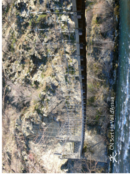
CN Sort i la Vall d'Assua

MORE INFORMATION: www.mapama.gob.es/en/desarrollo-rural/temas/caminos-naturales