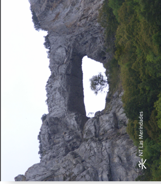
NT Las Merindades

which either run totally through Castilian territory or are shared with other Autonomous Communities.