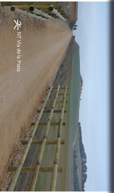
NT Vía de la Plata

Villablino Mining Railway (León). This trails follows the old railway line of the Minero Siderúrgica de Ponferrada (MSP) company, which linked Laciama with Ponferrada, and which runs parallel to the Sil River. Santander - Mediterranean (Soria). This trail is connected to the historical link between the Cantabrian coast and the Mediterranean Sea and runs across the Pinares county, in the province of Soria.