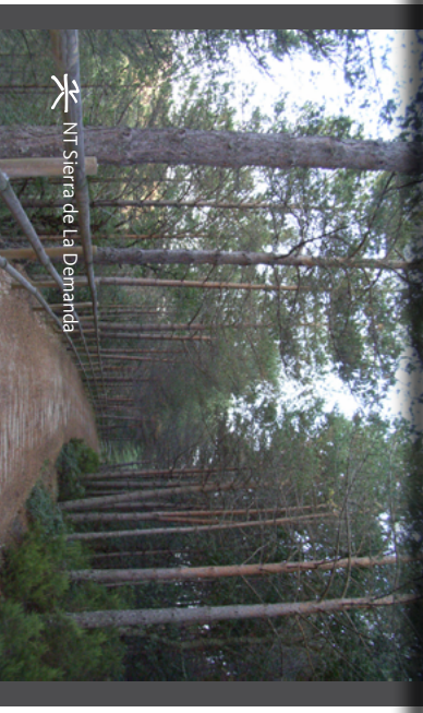
NT Sierra de la Demanda