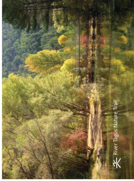
River Tagus Nature Trail

Cáceres- Badajoz corredor (Cáceres, Badajoz). This nature trail runs along 176,3 km, starting at the south of the city of Cáceres