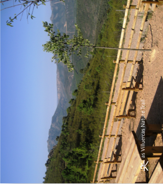
Las Villuercas Nature Trail

The 13 Nature Trails that are described in this booklet are located in a large area covering three Autonomous Communities (Madrid, Extremadura y Castile-La Mancha), which is vertebrated by its two main rivers, River Tagus and River Guadiana. This large area hides many landscapes and secluded areas, both natural and historical, for the walker to enjoy.