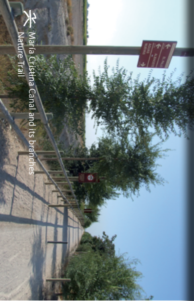
María Cristina Canal and its branches Nature Trail