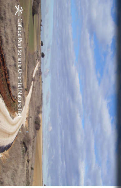
Cañada Real Soriana Oriental Nature Trail