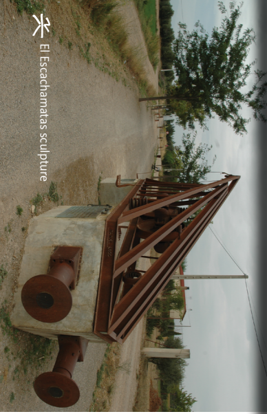
El Escachamatás sculpture