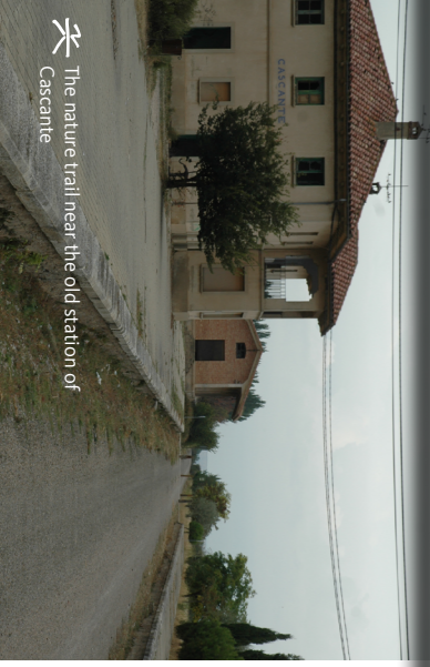
The nature trail near the old station of Cascante